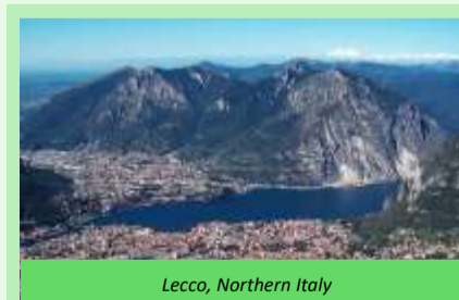
Lecco, Northern Italy